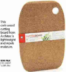
This cork-wood cutting board from Architec is lightweight and repels moisture.