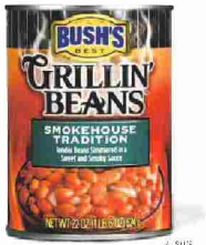
Bush's Grillin' Beans come in 4 sauces.

Bush's Grillin' Beans, heat-and-eat baked beans in barbecue sauce, bring quick, satisfying flavor to summer meals. The four sauces (Bourbon and Brown Sugar, Smokehouse Tradition, Southern Pit Barbecue and Steakhouse Recipe) are sweet but well-balanced. A 22-ounce can costs about $2.