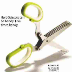
Herb Scissors can be handy. Five times handy.

Bush's Grillin' Beans, heat-and-eat baked beans in barbecue sauce, bring quick, satisfying flavor to summer meals. The four sauces (Bourbon and Brown Sugar, Smokehouse Tradition, Southern Pit Barbecue and Steakhouse Recipe) are sweet but well-balanced. A 22-ounce can costs about $2.